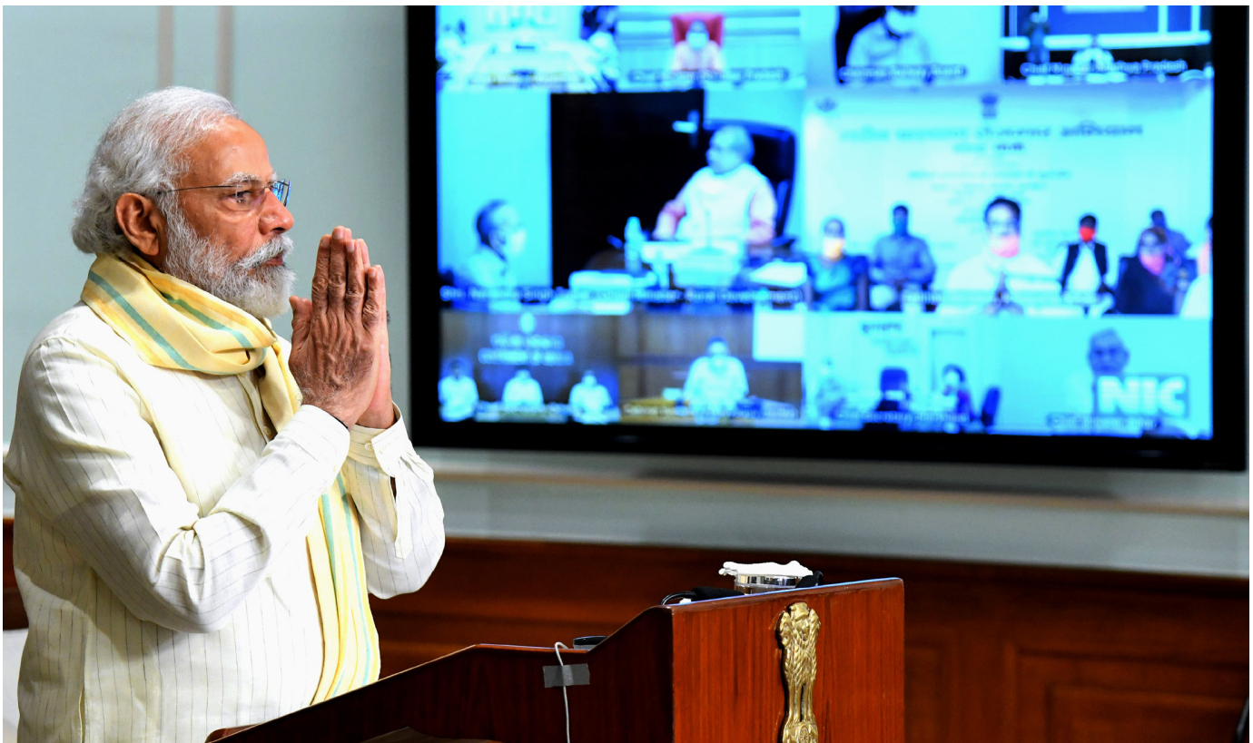
Prime Minister Narendra Modi at the launch of the Garib Kalyan Rojgar Abhiyaan through video-conferencing, in New Delhi on June 20

(At the launch of the auction for 41 coal blocks)