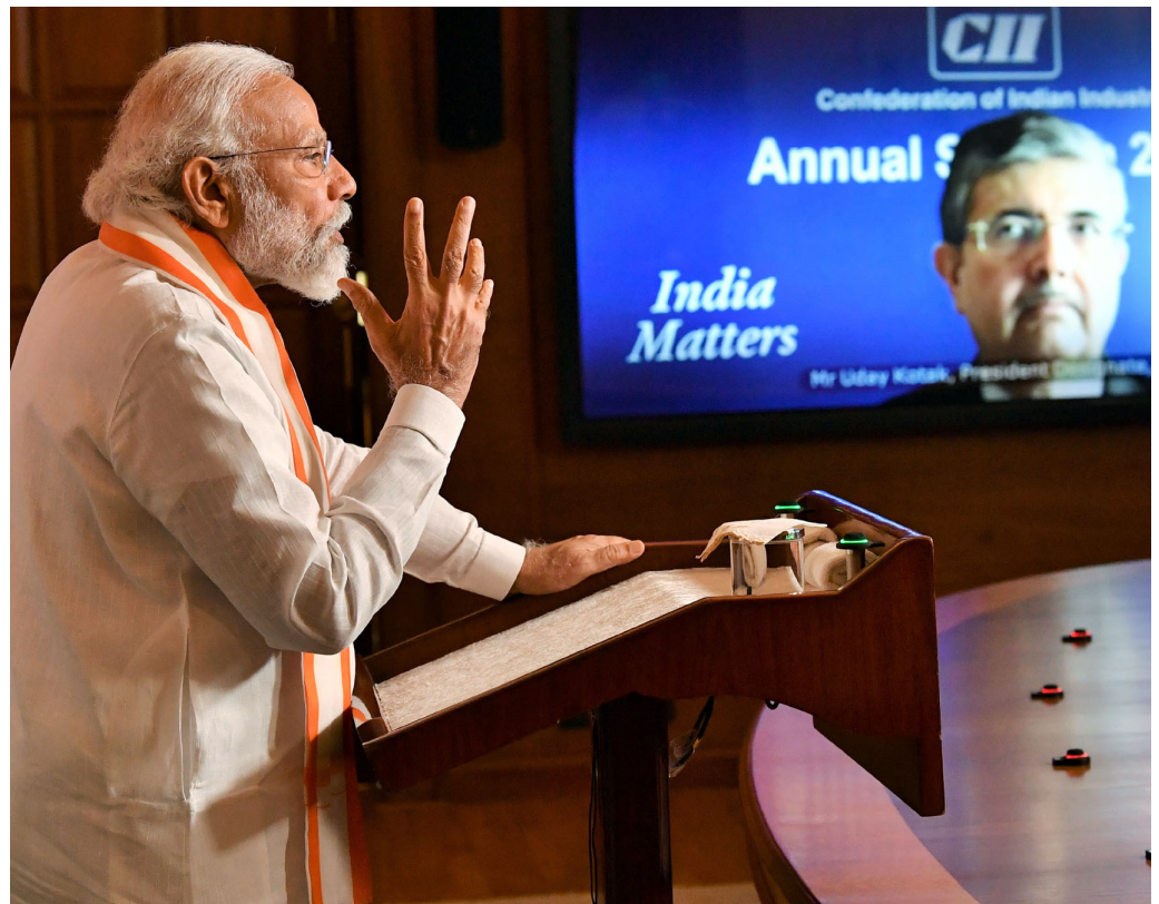
PM Modi delivering the inaugural address at the 125th Annual Session of Confederation of Indian Industries (CII) through video conference, in New Delhi on June 2

With an aim to boost domestic production and expand quality exports, the MEIS (Merchandise Exports from India) scheme is poised to be replaced