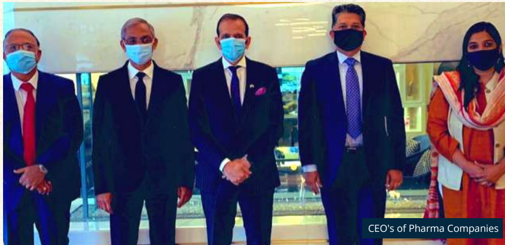
CEO's of Pharma Companies