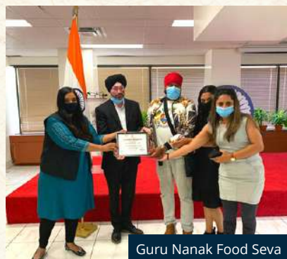
Guru Nanak Food Seva