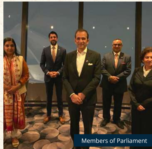
Members of Parliament