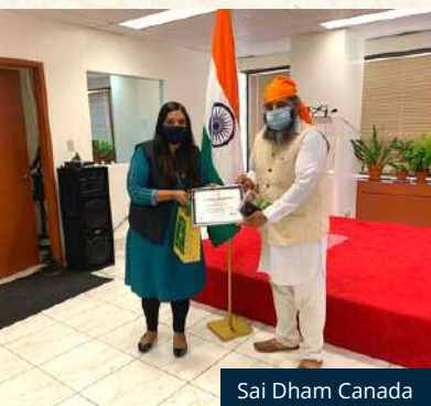
Sai Dham Canada