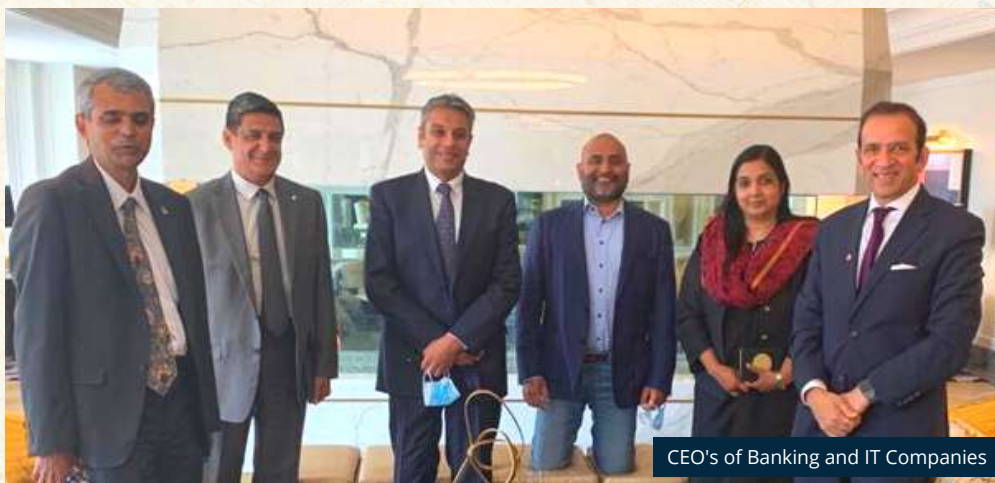
CEO's of Banking and IT Companies