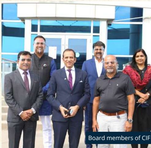
Board members of CIF