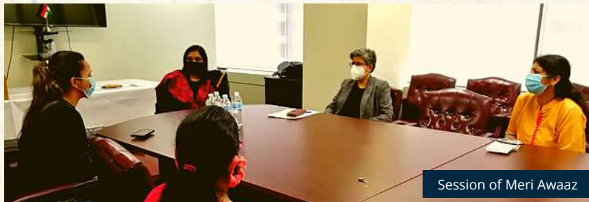
Session of Meri Awaaz