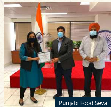
Punjabi Food Seva