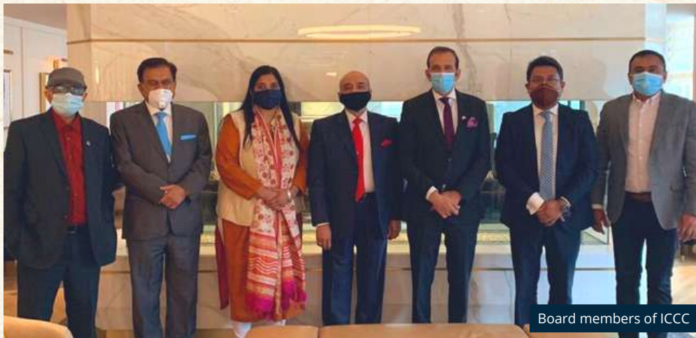
Board members of ICCC