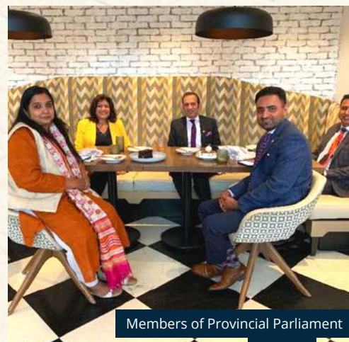
Members of Provincial Parliament