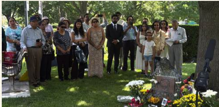
Location: Queen's Park