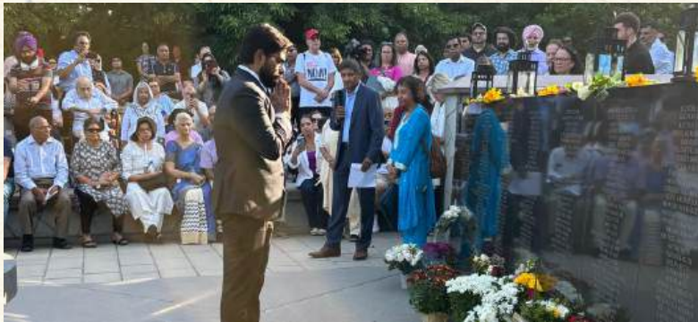
Location: Humber Bay Park