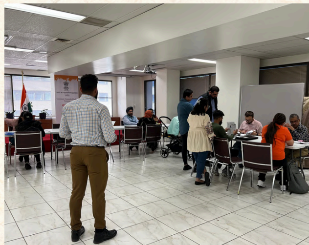
Picture taken during Open House at the Consulate premises

In March 2025, the Consulate facilitated the repatriation of four mortal remains of Indian citizens. Assistance was also extended to three distressed Indian women facing marital challenges. Additionally, the Consulate supported three cases involving missing persons and conducted a well-being check to ensure the safety of an Indian national.