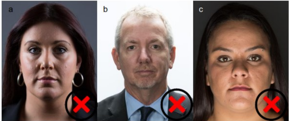
Non-compliant portraits: a) Side illumination, b) Top illumination, c) Bottom illumination.