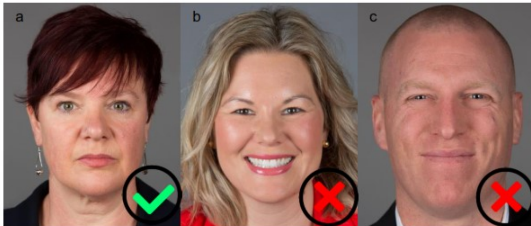
a) Compliant portrait, b) Smiling person, c) Person smiling with closed mouth.