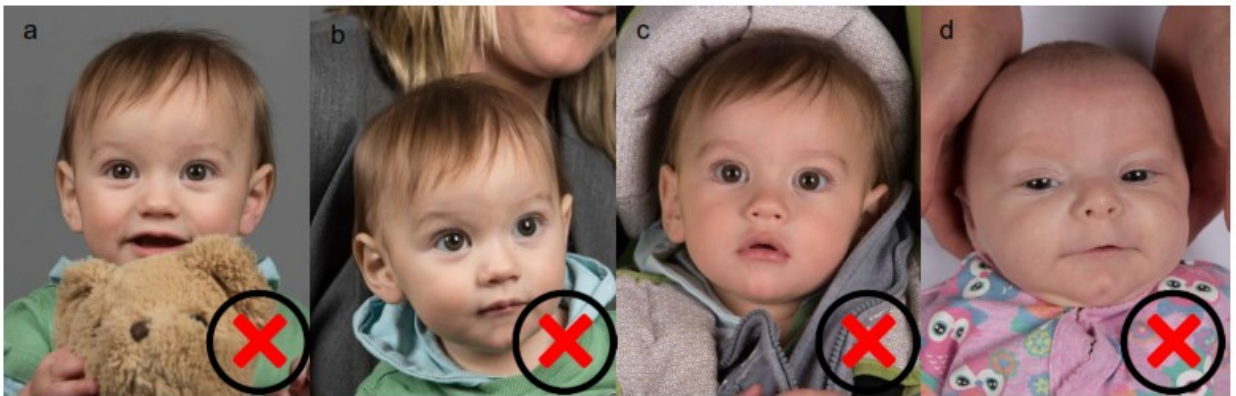
a) Toy, b) supporting person, c) Non-neutral background, d) Supporting hands.