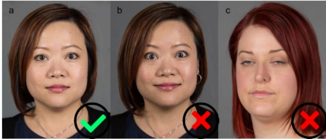
a) Compliant portrait, b) Unnaturally wide opened eyes, c) Eyes not fully opened.