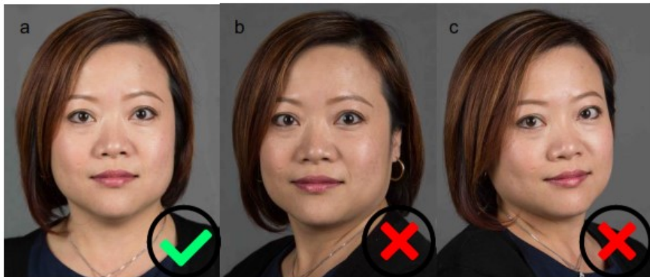
a) Compliant portrait, b) Shoulders not aligned toward the camera, c) Shoulders not aligned toward the camera, head tipped to the side.